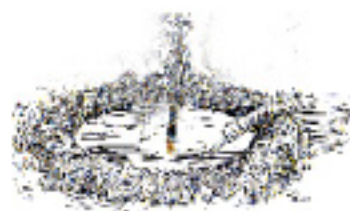
Basin inside raised ring

Before watering again, check the soil moisture daily. Water ONLY if soil feels barely damp at a depth of 2 to 3 inches. Soil should be kept moist, not soggy. When watering, fill the basin slowly 2 times. This ensures a thorough watering and helps to leach harmful mineral salts. After repeating this cycle several times, you will find a pattern of how often you need to water.